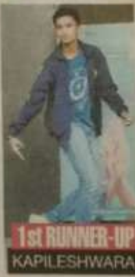
1st RUNNER-UP KAPILESHWARA