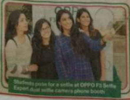
Students pose for a selfie at OPPO F2i Selfie Expert dual selfie camera phone booth